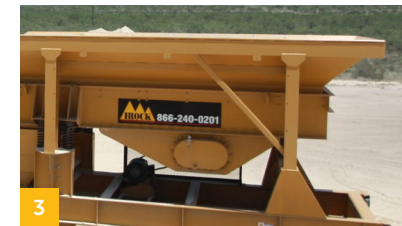
3 Fixed hopper design or hydraset hopper option on model. The patented Hydraset Hopper™ simplifies the connection and removal of the hopper/feeder. An internal power pack allows just one operator to attach and detach the unit for transportation in minutes.