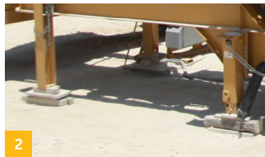
2 Standard hydraulic outriggers make for quick machine setup.