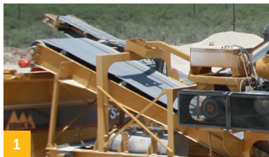
1 The optional in-line discharge belt features a heightened discharge point that reaches 10' 11" for higher stockpiling.