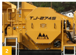
2 True 45" x 27" jaw with reversible hydrostatic drive, reversible jaw plates, and twin hydraulic ram wedge closed side setting (CSS) adjust.