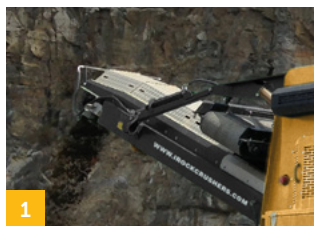
1 Extended 42' main conveyor as standard, giving large stockpile capacity. Conveyor lowers and raises hydraulically.