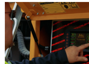
User friendly waterproof and dustproof control panel. Allows monitoring of pressures, fluid levels and fuel consumption. Provides push button control of jaw, track and feeder functions.