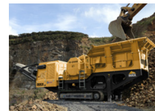
At only 8' 2.5" wide, the TJ-2745 is easily transported between job sites.