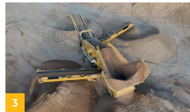
3 Hydraulic, folding side conveyors allow easy transport and set-up times of 10 minutes or less.