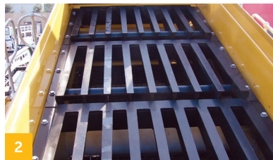
2 High-energy, two-bearing, 16' x 5' screen box, with 157ft² of screening area can sort up to three different product sizes. Optional top deck bofar bars, top deck punch plate, heavy-duty top finger deck and bottom finger deck.