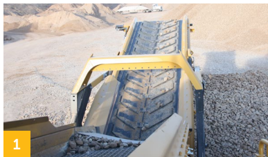
1 A 63" wide discharge conveyor, the widest in the industry, reduces jamming at the screen's discharge point.