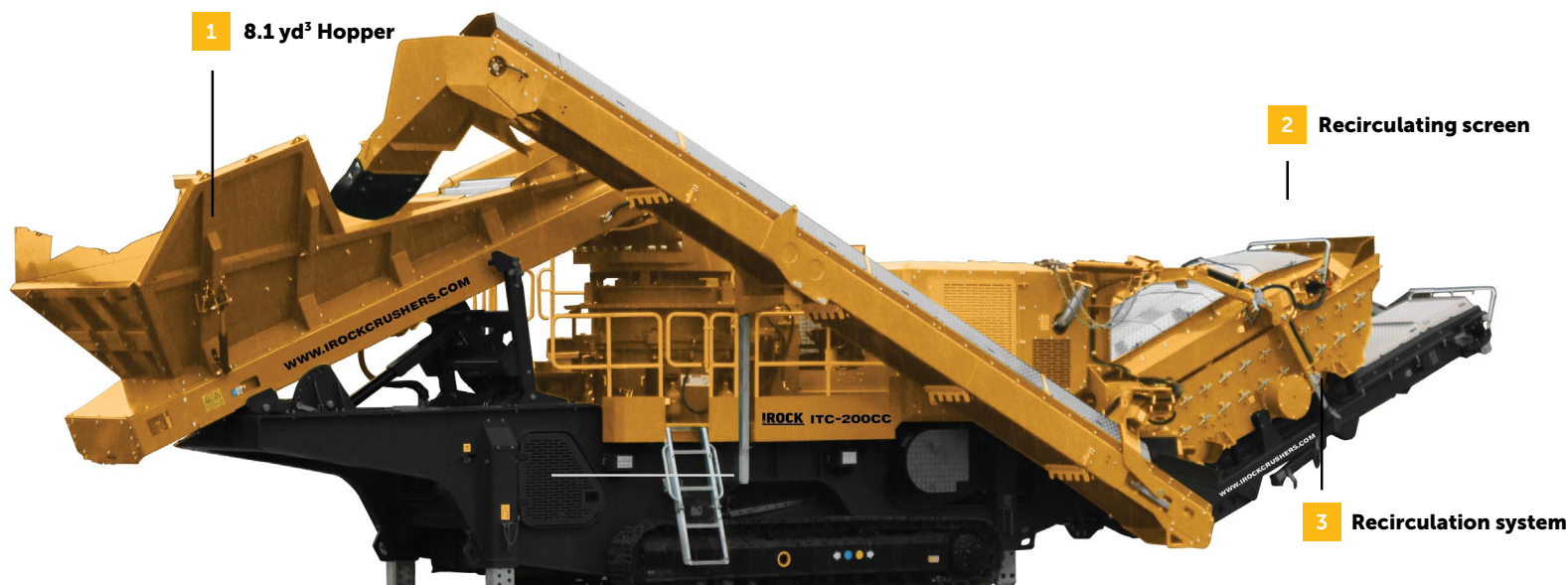
1 8.1 yd 3 Hopper