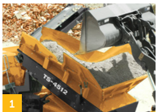
1 7.8 yd 3 (6 m 3 ) hopper equipped with a 48" (1200 mm) heavy duty 4-ply belt designed for heavy duty applications.